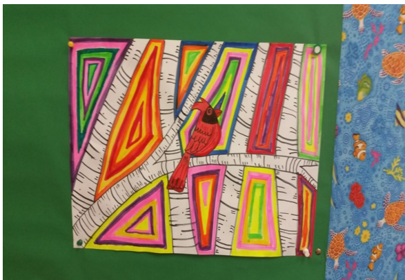
Shayna's bird on a beech tree