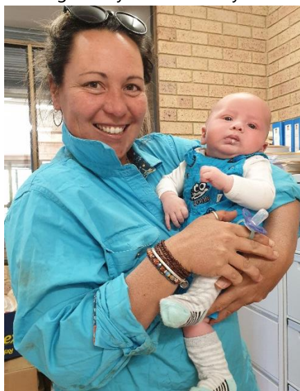
Update – Mummy and Harley 14 Oct.