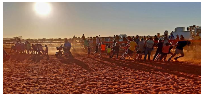
Landor Crowds having fun!