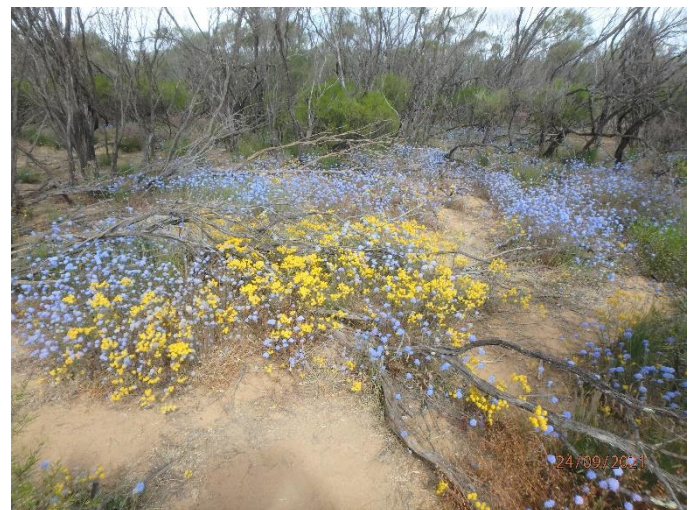
More wildflowers, just gorgeous!