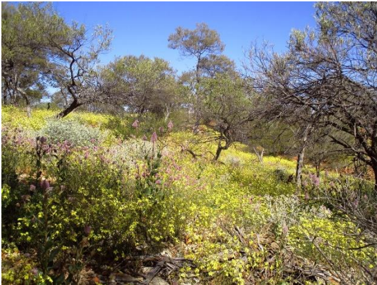
The famous Wreath Flowers

This year's wildflowers were just stunning...here are a few pics taken by some travellers.