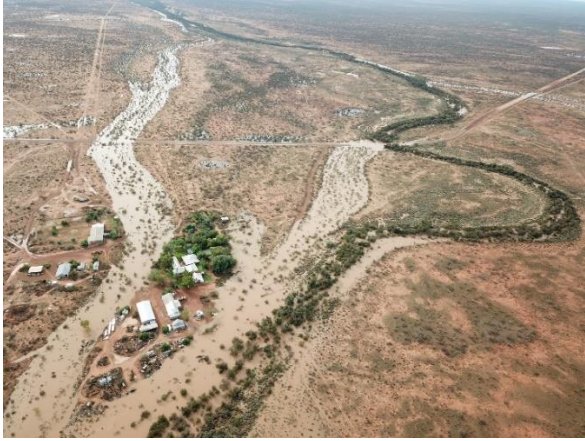
Greenough River at Yuin Station 30.03.22