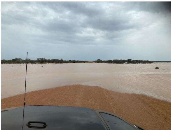
Sanford River Floodwaters over Twin Peaks-Wooleen Road 1.04.22