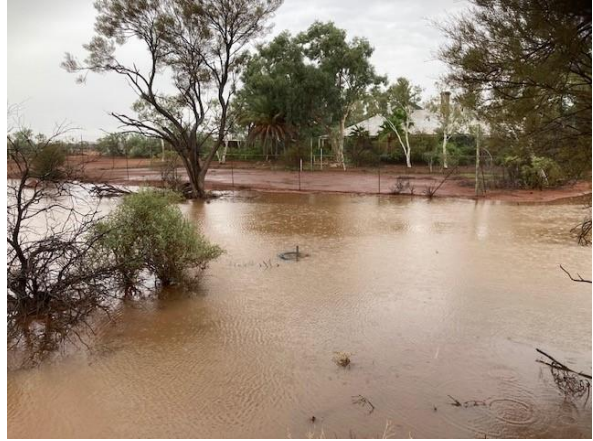
Sanford River Floodwaters adjacent Twin Peaks Station 1.04.22