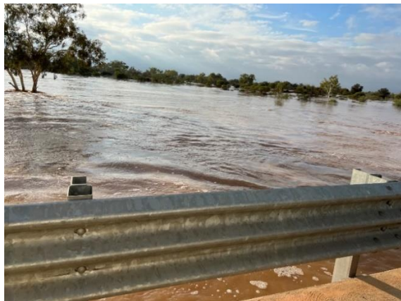
Carnarvon-Mullewa Road Crossing Murchison River (low level floodway submerged) Upstream View from Bridge 4.04.22