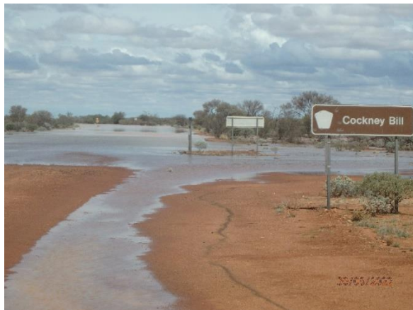
Beringarra-Pindar & Woollen-Mt Wittenoom Rd Intersection 30.03.22