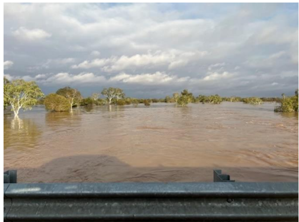
Carnarvon-Mullewa Road Crossing Murchison River Downstream View from Bridge 4.04.22