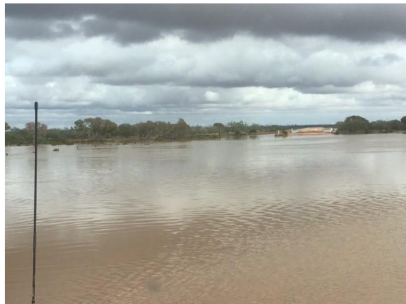
Sanford River Floodwaters over Twin Peaks-Wooleen Road 4.04.22