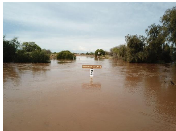
Greenough River Crossing of Beringarra-Pindar Rd at Yuin Station 30.03.22